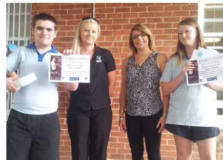
Thank you Grafton Shoppingworld for your generous donation of the two Mini iPads for GHS PBL initiative.