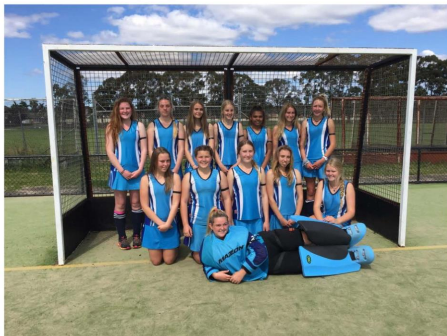
Grafton Girls Hockey Team 2015- Placed 6 th in the CHS State Knock-Out