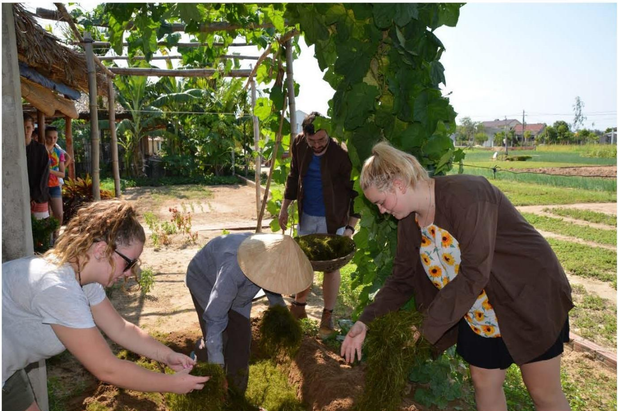
Lining herb beds with seaweed before planting Vietnamese basil

After lunch, we continued exploring the town, but this time on bicycle. Some members of the group struggled to stay on the bike, and were very lucky to NOT hit the tree on the way down. However, nobody was hurt and we made it to a local herb farm, owned by a large Vietnamese family. Upon arriving, we were given traditional farming outfits, which consisted of a cone hat, and a brown smock. They showed us the different herbs, they were growing and how they planted them.