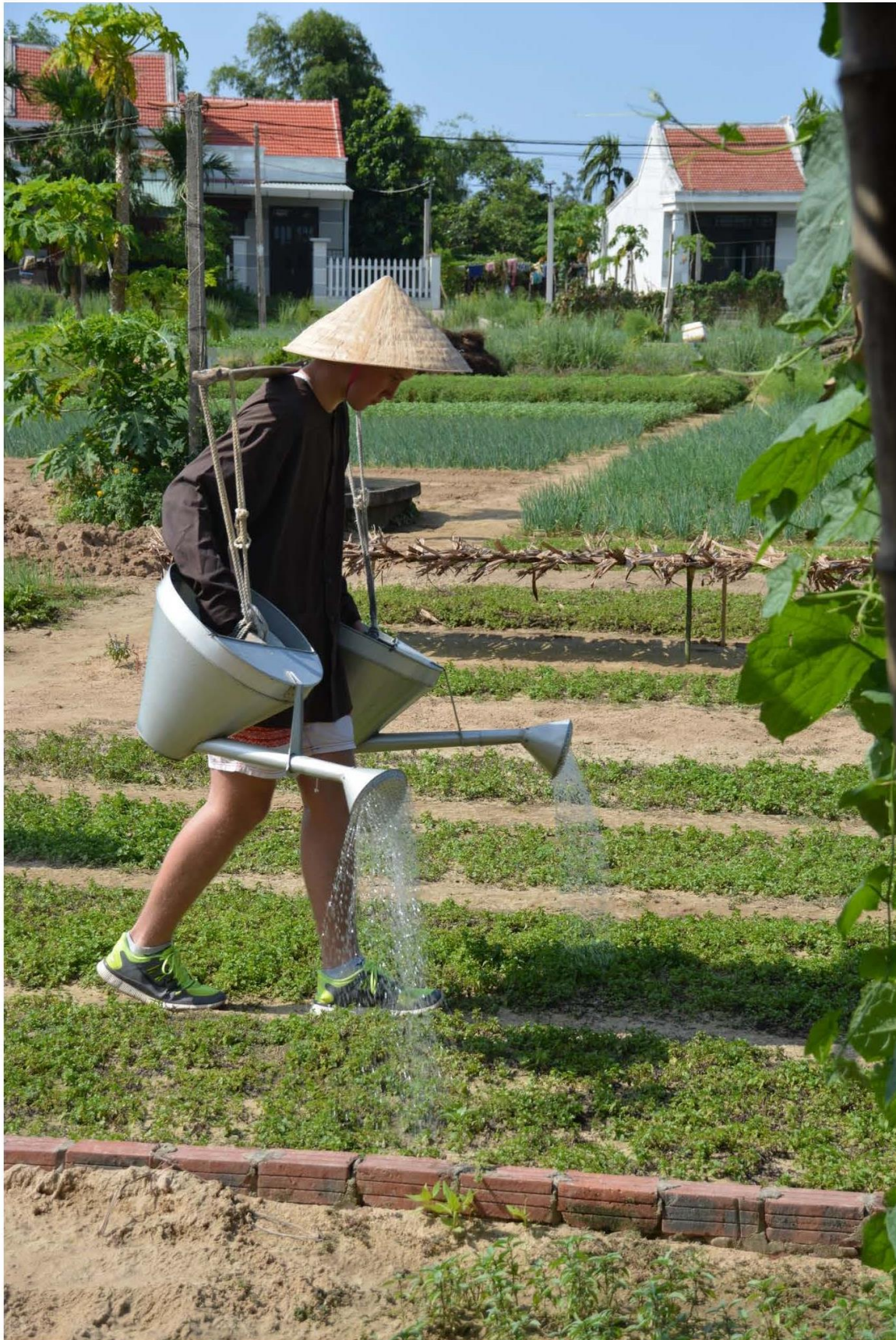
Watering plants Vietnamese style