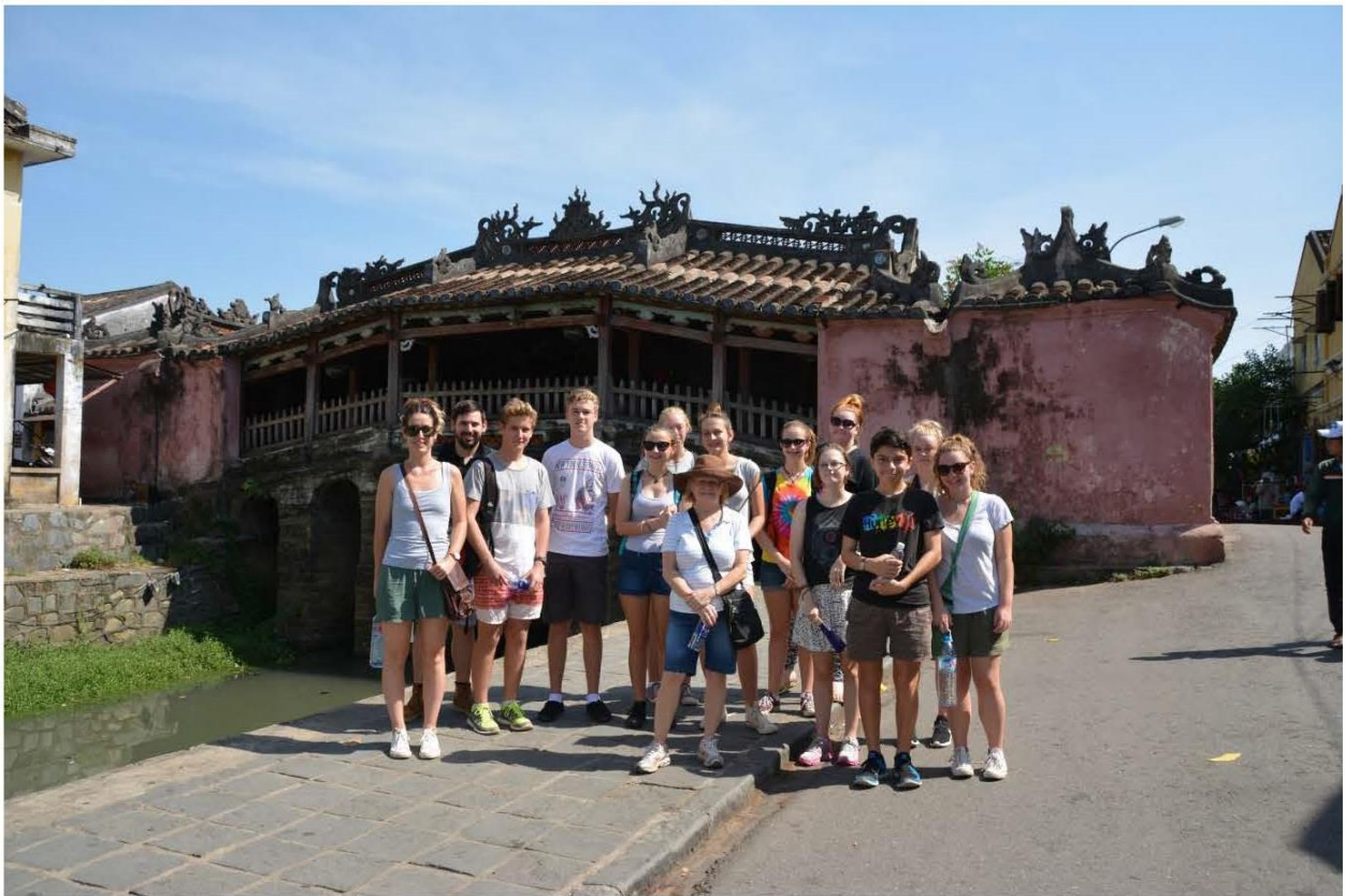
Japanese Bridge, Hoi An

After lunch, we continued exploring the town, but this time on bicycle. Some members of the group struggled to stay on the bike, and were very lucky to NOT hit the tree on the way down. However, nobody was hurt and we made it to a local herb farm, owned by a large Vietnamese family. Upon arriving, we were given traditional farming outfits, which consisted of a cone hat, and a brown smock. They showed us the different herbs, they were growing and how they planted them.