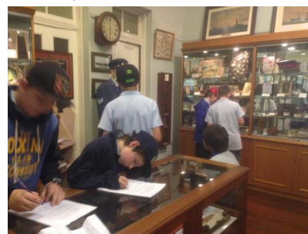
Year 7 boys researching war artefacts at Schaeffer House