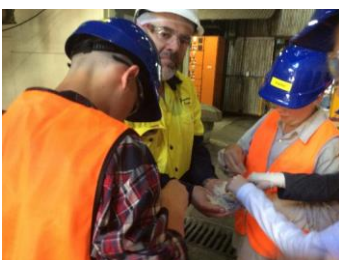
Checking the quality of the product