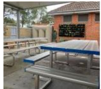
Tables and Benches