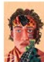
2022 Young Archie Competition Winner, 11-15 years, 1st Prize, 2022