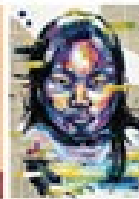
2022 Young Archie Competition Winner, 11-15 years, 2nd Prize, 2022