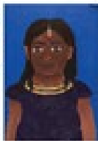
2022 Young Archie Competition Winner, 11-15 years, 4th Prize, 2022