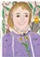
2022 Young Archie Competition Winner, 11-15 years, 3rd Prize, 2022