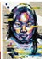
2022 Young Archie competition 15-18 years (Male/Female/Trans) up to 18 years