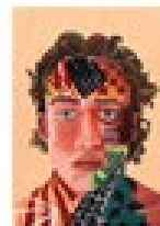
2022 Young Archie competition 15-18 years (Male/Female/Trans) up to 18 years

Term 4: ArtAfterSchool.eventbrite.com.au