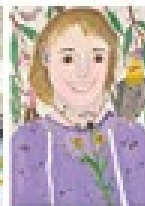
2022 Young Archie competition 15-18 years (Male/Female/Trans) up to 18 years