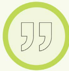
Conventions of language (spelling, grammar and punctuation)