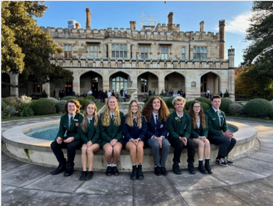
Above: Clarence Valley's School Captains looking very flash at Governor House.