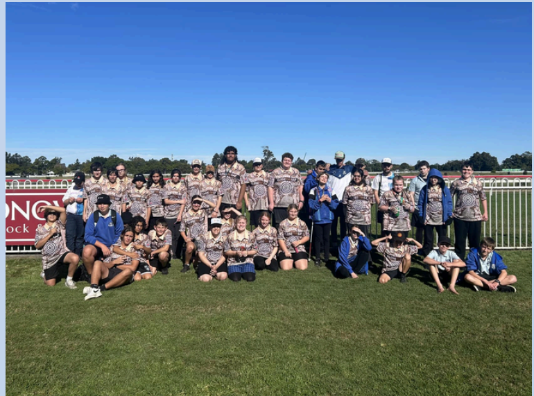
Looking great in their new polos!