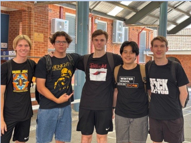
Left: Students wore band t-shirts for the GHS Battle of the Bands competition.

The GHS Student Representative Council has been collecting donations from the school community to donate to the Salvation Army who put these items into hampers for families in need. Our school community has been able to rally together and support families during the holiday period. We sincerely thank all donors for their generous gifting and the SRC for their organisation.