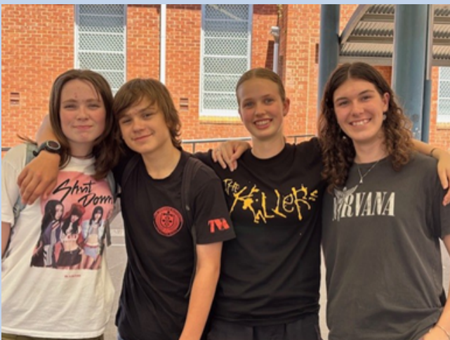
Below: SRC with some of the donated hamper items.