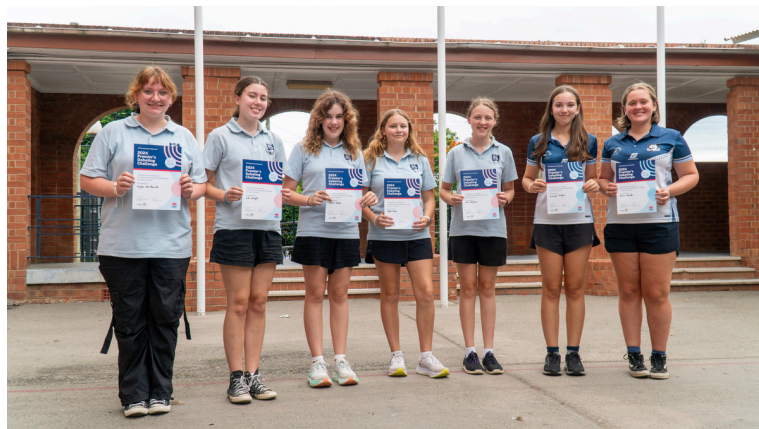
2024 debating students were awarded with a certificate for participation in the Premier's State Debating Challenge.